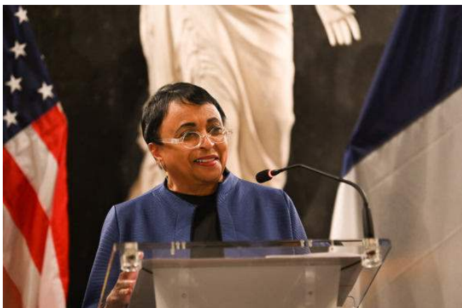
Dr. Carla Hayden, Librarian of Congress.