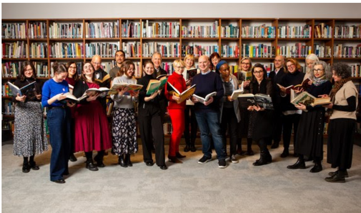
Staff and Trustees of the American Library in Paris.

Thank you for being part of this extraordinary year. We look forward to seeing you in 2025. In the meantime, restore, renew, and read.