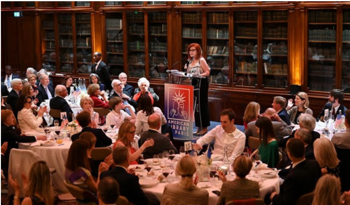
Maureen Dowd at the American Paris in Library's 2024 Gala.

In 2024, you—our readers, members, and supporters—enriched the Library as a hub of learning, conversation, and community. Together, we welcomed the Librarian of Congress, spoke with Pulitzer Prize-winners, held our first multidisciplinary festival, hosted a roaring 1920s party, introduced board games to the collection, and shared countless other unforgettable chapters.