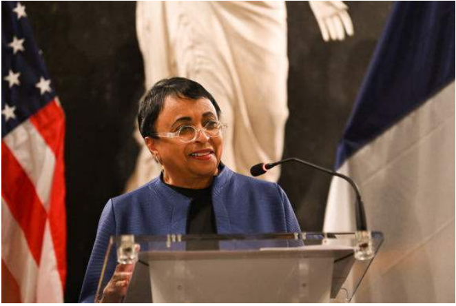
Dr. Carla Hayden, Librarian of Congress.