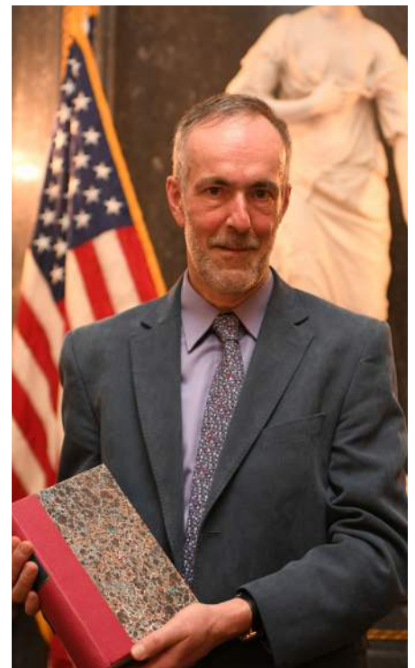
2022 Book Award Ceremony celebrating the winning title, France: An Adventure History by Graham Robb, at the Hôtel de Talleyrand on the Place de la Concorde.