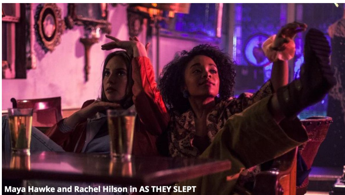
Maya Hawke and Rachel Hilson in AS THEY SLEPT

The Champs-Élysées Film Festival opens Tuesday 9 June. Each year the Library partners