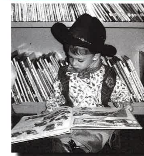
A little cowboy enjoys our Children's Collection.