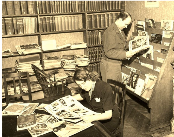
LIVING HISTORY A French woman and American soldier consulting magazines at the Library circa 1945