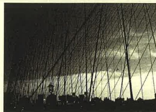
Cables, digital photo by C. Noblet

The suspended bridge has also been photographed and painted by early American Modernist masters, in celebration of architecture, industry and its impact on American art.