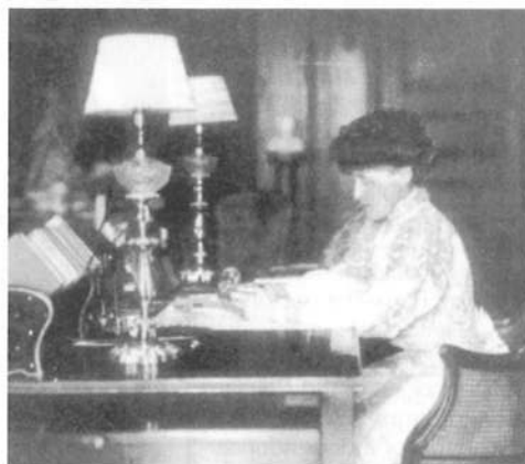
"Edith Wharton at The Mount, 1905"