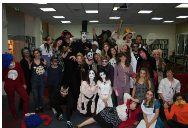
The Library's team of staff, interns and volunteers after three hours of tours of the Haunted Library!

secret messages of the Underground Railroad.